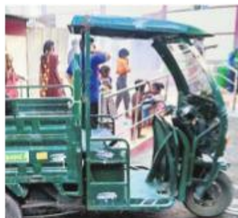
Food brought by a garbage collection vehicle being provided at the shelter in Periyamet; (right) Unhygienic conditions at the shelter

When TNIE visited the shelter at 2 pm, the food remained untouched. “The driver said the food was hygienic and the vehicle had not been used to collect garbage recently,” said Vinodh, a relocated dweller. The zonal officials said, “The vehicle is not used for carrying garbage although it looks the same.” However, green-coloured vehicles are used only to collect