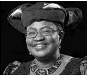
This is WTO Director-General Ngozi Okonjo-Iweala’s first visit to India

“The present text is imbalanced. Only when India’s suggestion is considered and incorporated suitably, will it be a balanced text for negotiations. The present text cannot form the basis of negotiations. We have suggested a proposal on getting future policy space and common but differentiated responsibility for different categories of countries,” said a senior government official.