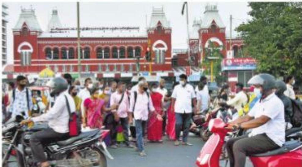
Pedestrians brave the traffic, ignoring the subway near the Chennai Central Railway Station

One of the arterial infrastructure for pedestrians, many subways in the city are in a state of neglect. Built at an estimated cost of ₹3.85 crore and opened just a couple of years ago, the subway connecting East and West Tambaram is also a picture of apathy. With absolutely no illumination, public, especially women, are hesitant to